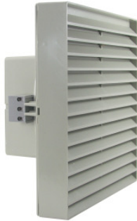
LS 0 K