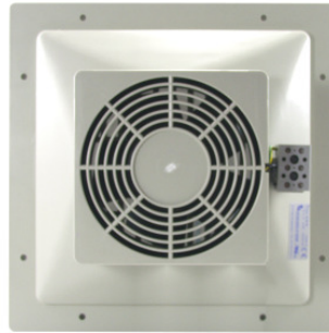
LS 0 (K)